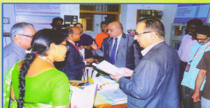
NAAC-PEER-TEAM Members interacting with faculty members