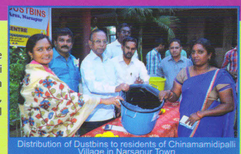
Distribution of Dustbins to residents of Chinamamidipalli Village in Narsapur Town