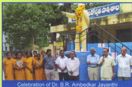
Celebration of Dr. B.R. Ambedkar Jayanthi

1. N.S.S. volunteers of our college participated in Rally on the occasion of 7th National Voters Day on 25th January, 2017. They made awareness on the importance of registration for enrolment in the voters list that who completed the age of 18 years.