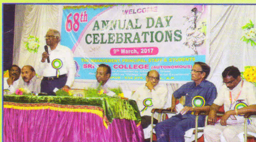
Chief Guests, Invitees, Management Committee Members on the dais