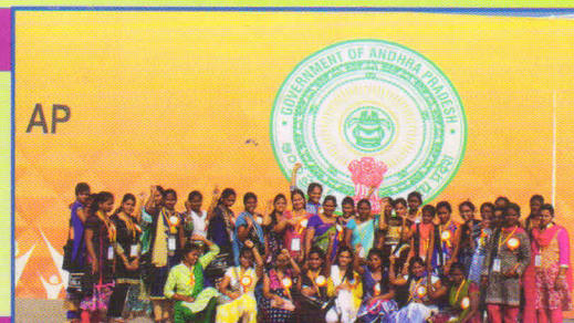
Staff and Students participated in the National Womens Parliament in Amaravathi