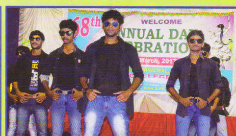
Cultural Performances by students

Sri Y.N. College (Autonomous) Newsletter " Reflections " sponsored by UGC-CPE is intended to showcase the talents of faculty & students and highlight the achievements of the college. Distributed freely in the Academic interest of the College.