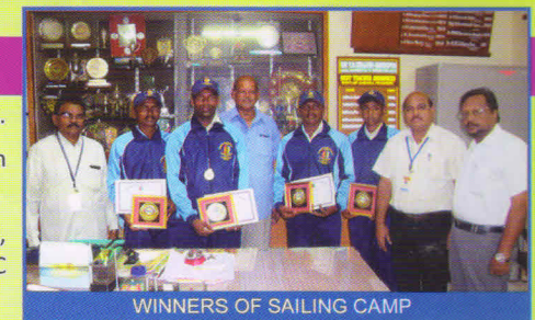
WINNERS OF SAILING CAMP

6. 38 Cadets appeared for "B" Certificate and 14 Cadets attended for "C" Certificate examinations in the month of February, 2017.