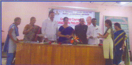
Awarding of Certificates to Gandhi Course Students in ASD Govt. Degree College for Women, Kakinada

2. Three Months Certificate Course was inaugurated to the students of ASD Govt. Degree College for Women, Kakinada, E.G.Dist.