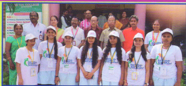
MBA students participated in National Women Parliament with management