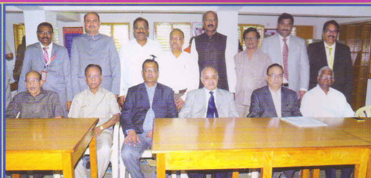
Management Committee Members, Principal and others with NAAC Peer Team Members