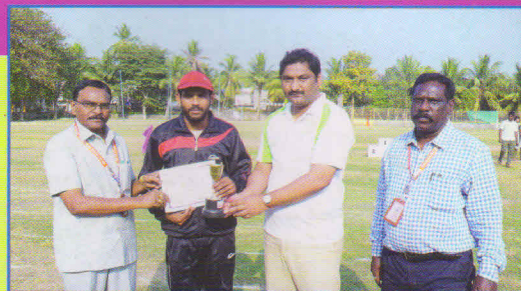
Distribution of prizes to students winners