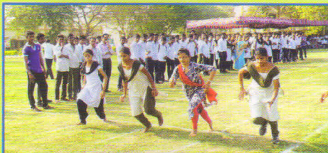
Students participating in Sports events