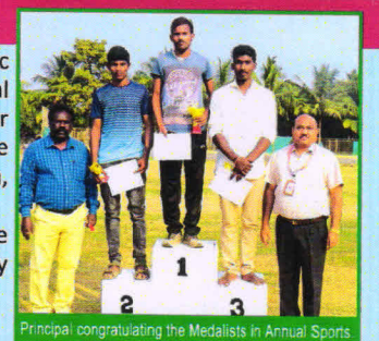
Principal congratulating the Medalists in Annual Sports