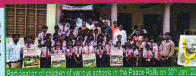
Participation of children of various schools in the Peace Rally on 30 th Jan. 2019