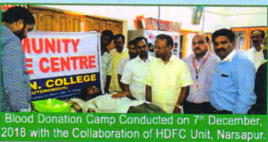
Blood Donation Camp Conducted on 7 th December, 2018 with the Collaboration of HDFC Unit, Narsapur.