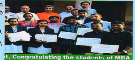
t, Congratulating the students of MBA