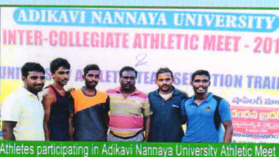
Athletes participating in Adikavi Nannaya University Athletic Meet.