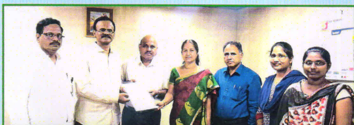
Managing Director, Gowthami Solvent Oils Ltd. Tanuku is giving MOU letter to the Principal on 20-3-2019.