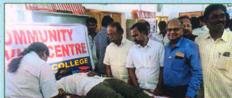
CSC and Lions Club, Narsapur, Jointly conducted to the Blood Donation Camp, on 02-03-2019.