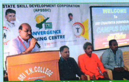
Chaitanya Techno Group - AP Conducting Campus Placements

• The Centre organized campus placements conducted by VIJAYASRI ORGANICS LIMITED, VISAKHAPATNAM. 25 Students attended two students got placements on 09-02-2019.