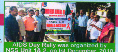
AIDS Day Rally was organized by NSS Unit 1 & 2, on 1st December, 2018