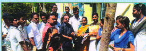
Distribution of Garbage Bags in Royapeta, on 14-03-2019.