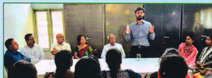
Management of Gowthami Solvent Oils Ltd. Tanuku Interactions with the staff and students