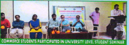
COMMERCE STUDENTS PARTICIPATED IN UNIVERSITY LEVEL STUDENT SEMINAR