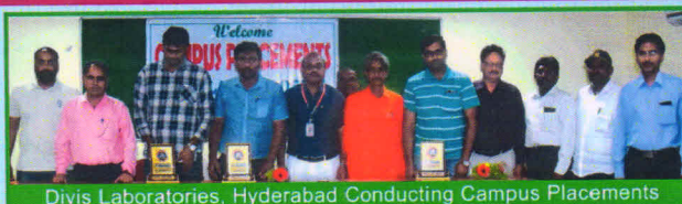
Divis Laboratories, Hyderabad Conducting Campus Placements

• The Centre Trained Mukyamantri Yuva Nestam programme for unemployed youth. The Centre attended 4 batches and 120 students attended from 10-12-2018 to 5-2-2019.