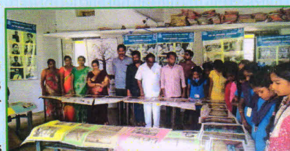
A Photo exhibition on Gandhiji was organized on 26 th Jan 2019 at Oriental ZPH School, Kalipatnam, Mogaltur Mandal.