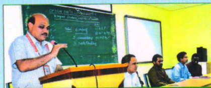
The HRD Centre organized Training programme for Degree final year students sponsored by APSSDC.

• The Centre Trained Mukyamantri Yuva Nestam programme for unemployed youth. The Centre attended 4 batches and 120 students attended from 10-12-2018 to 5-2-2019.