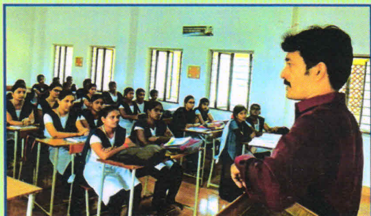
Chinmaya Viswa Vidya Peeth Ernakulam, Kerala on 22-02-2020.