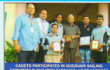
CADETS PARTICIPATED IN GODAVARI SAILING EXPEDITION IN 2017 FROM RADRACHALAM TO KAKINADA