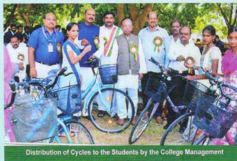
Distribution of Cycles to the Students by the College Management