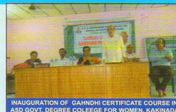
INAUGURATION OF GANDHI CERTIFICATE COURSE IN ASD GOVT. DEGREE COLLEGE FOR WOMEN, KAKINADA