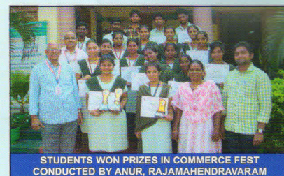
STUDENTS WON PRIZES IN COMMERCE FEST CONDUCTED BY ANUR, RAJAMAHENDRAVARAM