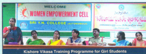
Kishore Vikasa Training Programme for Girl Students

The cell organized Awareness programme on Sexual Harassment and Self Defence training programme to the girl students through audio visuals. The students practically learnt some important and useful, easy techniques to defend themselves when they face any danger in their day to day life. The cell has very useful DVDs, Audio CDs and Books which are quite useful to enhance the knowledge and awareness of the students on various women issues. On 19th September, 2017 the Women Empowerment Cell organized 'Train the Trainer Programme - Kishori Vikasam' (a scheme for Empowerment of Adolescent Girls) in collaboration with the Dept of Women Development and Child Welfare. Fifty Girl Students of Final year Degree were trained as Peer Group Trainers.