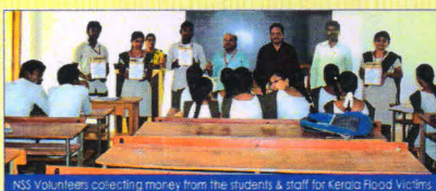
NSS Volunteers collecting money from the students & staff for Kerala Flood Victims.