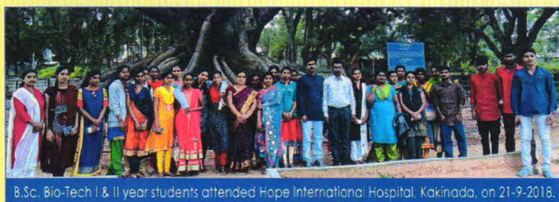
B.Sc. Bio-Tech I & II year students attended Hope International Hospital, Kakinada, on 21-9-2018.

• B.Sc. Botany Students went to Bangalore and Mysore on 19-11-2019 to 23-11-2019, on the part of Educational Tour conducted by Botany Dept.