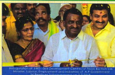
Inauguration of HRD -Skill Development Centre(1 st Floor) by Hon'ble Minister, Labour, Employment and Industries of A.P Government Sri Peethani Satyanarayana on 2-7-2018.