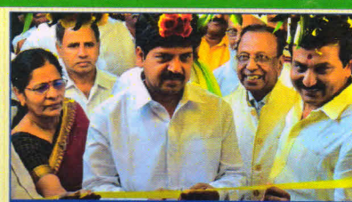
Inauguration of Garment Making Centre by Hon'ble Minister, Law, Sports and Skill Development of A.P. Government Sri Kollu Ravindra on 2-7-2018.