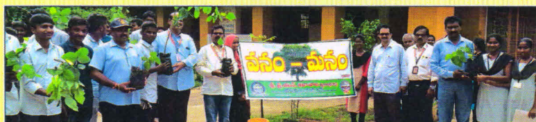
Principal, Staff and students participated in the 'VanamManam' Programme and planted plants in the college campus on 16-7-18.

1. Volunteers participated in Navanirman Deeksha Varostavalu-2018 from 2nd June, 2018 to 8th June, 2018. They participated in the programme at Saripalli, Chinamamidipalli and Narsapur Town. They conducted several awareness as well as traditional programmes.