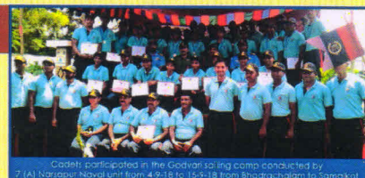
Cadets participated in the Godvari sailing camp conducted by 7 (A) Narsapur Naval unit from 4-9-18 to 15-9-18 from Bhadrachalam to Samalkot