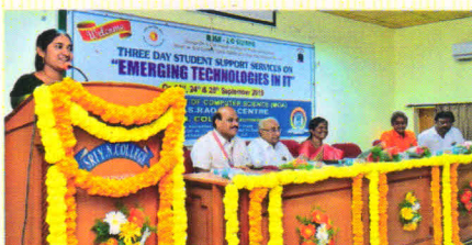
of Mathematics(P.G & U.G).