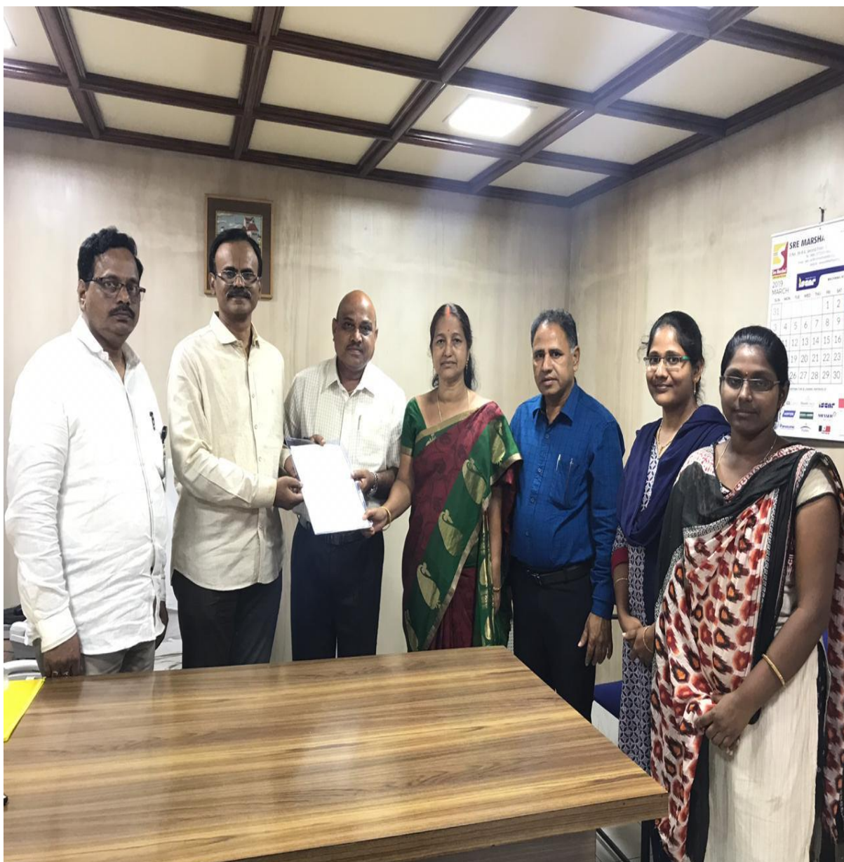
Managing Director, Gowthami Solvent Oil Ltd., Tanuku, exchanging MOU letter to the Principal on 20-3-2019.