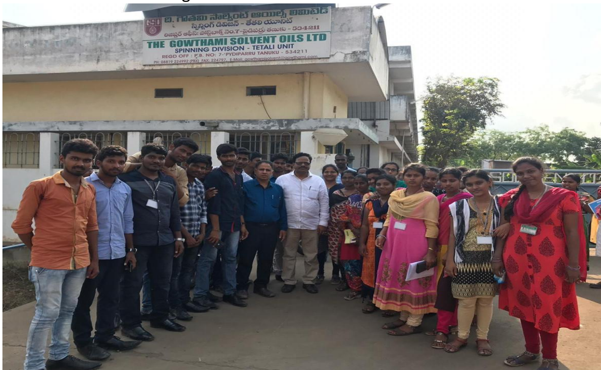
MBA Students visited GSO Ltd., Tanuku on 20-3-2019