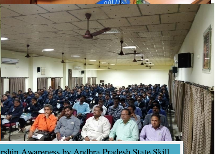
Two-Day Workshop on Entrepreneurship Awareness by Andhra Pradesh State Skill Development Corporation