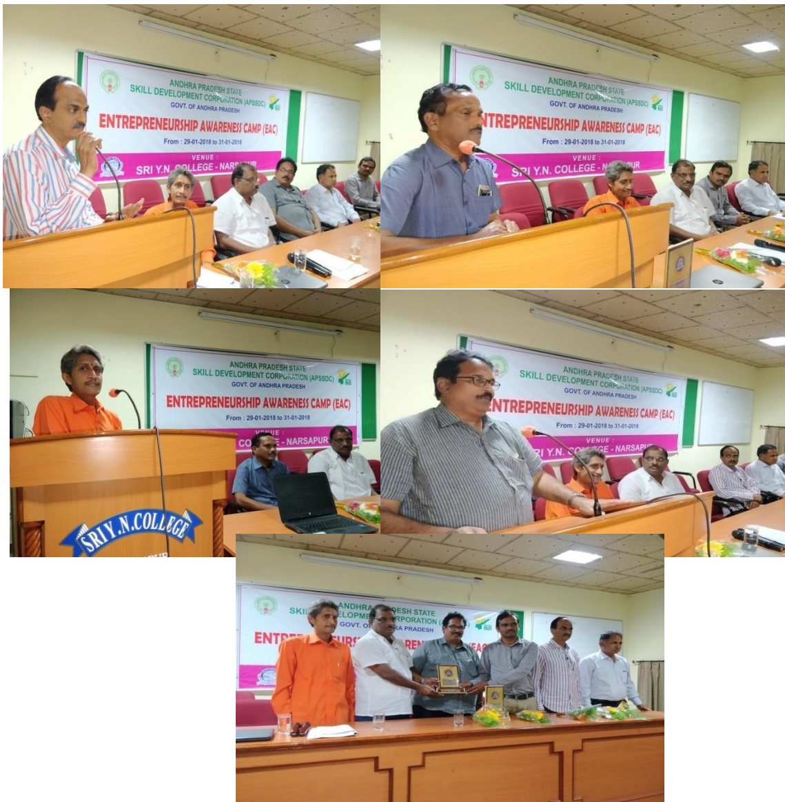
Two-Day Workshop on Entrepreneurship Awareness by Andhra Pradesh State Skill Development Corporation