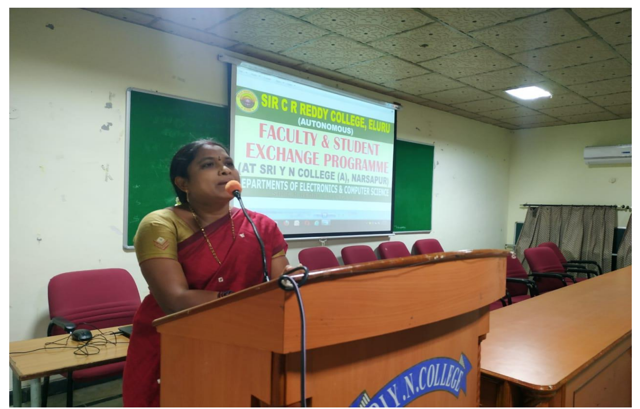
Student Exchange Programme with Sir C.R.Reddy College, Eluru