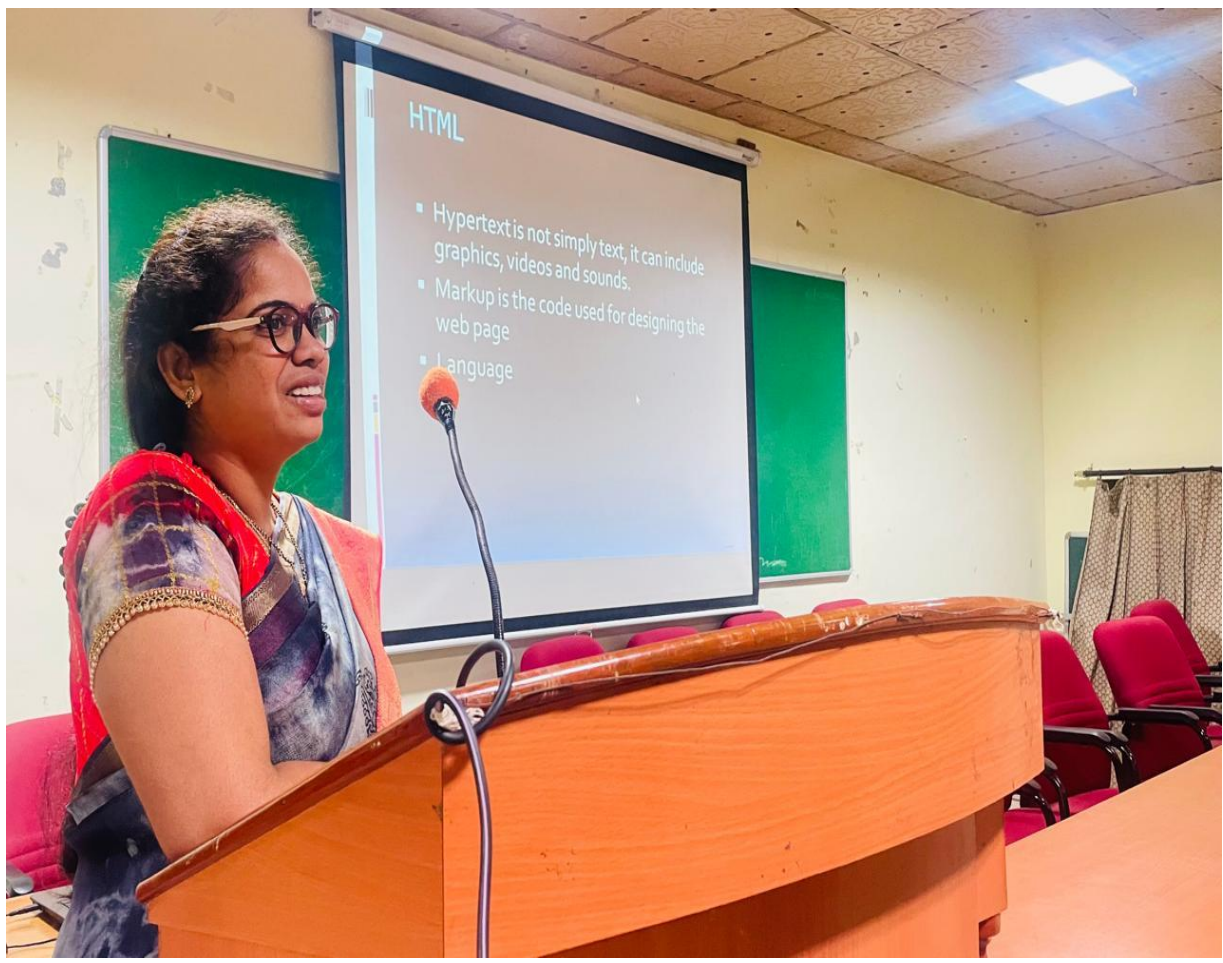
Student Exchange Programme with Sir C.R.Reddy College, Eluru