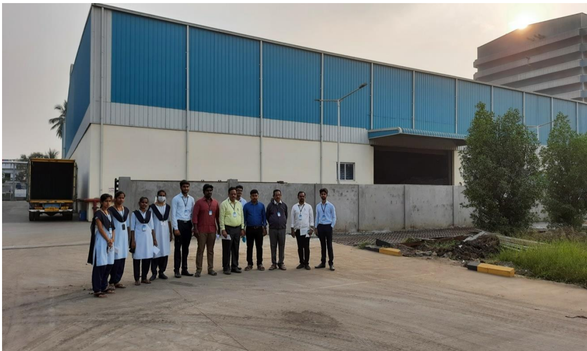
MBA II year Students went to Palakol, Sandhya Marine Exports Ltd., on 20-12-2021, on the part of Industrial Visit.