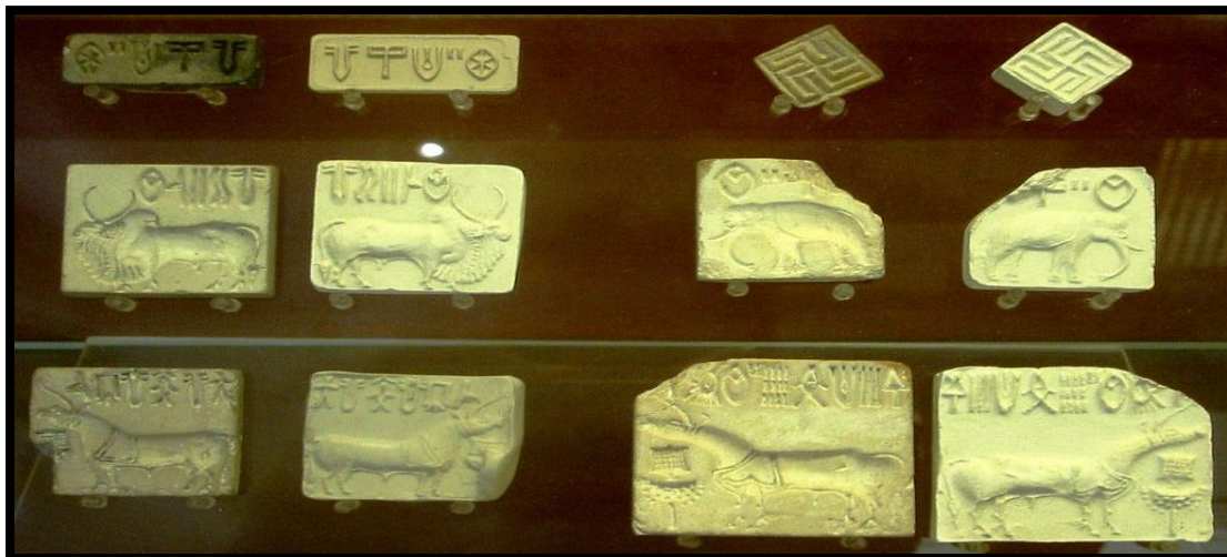
A COLLECTION OF INDUS VALLEY SEALS

The Harappan religion also remains a topic of speculation. It has been widely suggested that the Harappans worshipped a mother goddess who symbolized fertility. In contrast to Egyptian and Mesopotamian civilizations, the Indus Valley Civilization seems to have lacked any temples or palaces that would give clear evidence of religious rites or specific deities.