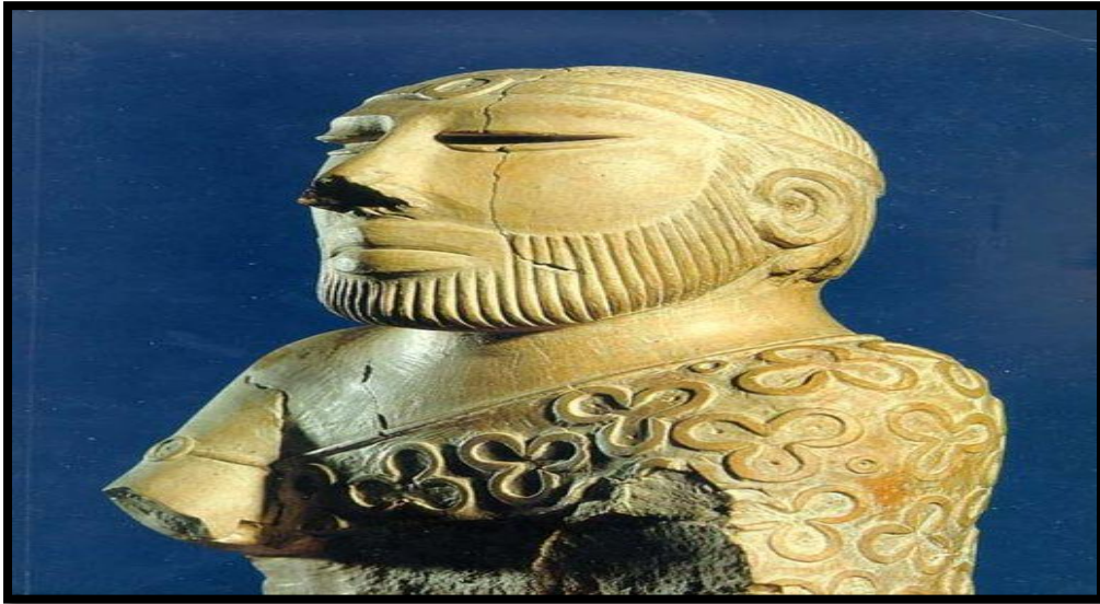
INDUS PRIEST/KING STATUE. THE STATUE IS 17.5 CM HIGH AND CARVED FROM STEATITE. IT WAS FOUND IN MOHENJO-DARO IN 1927.

Indus Valley excavation sites have revealed a number of distinct examples of the culture's art, including sculptures, seals, pottery, gold jewelry, and anatomically detailed figurines in terracotta, bronze, and steatite.