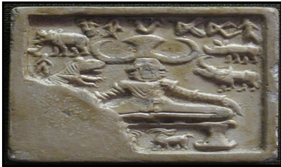
MOLD OF A SEAL FROM THE INDUS VALLEY CIVILIZATION

Harappans are known for seal carving — the cutting of patterns into the bottom face of a seal , a small, carved object used for stamping. They used these distinctive seals for the identification of property and to stamp clay on trade goods. Seals—decorated with animal figures, such as elephants, tigers, and water buffalos—have been one of the most commonly discovered artifacts in Indus Valley cities.