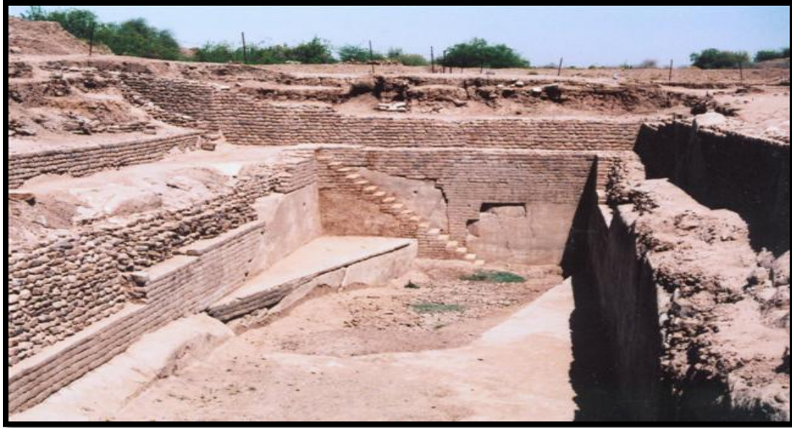
ARCHAEOLOGICAL DIG OF A WATER RESERVOIR AT DHOLAVIRA

Harappans are known for seal carving — the cutting of patterns into the bottom face of a seal , a small, carved object used for stamping. They used these distinctive seals for the identification of property and to stamp clay on trade goods. Seals—decorated with animal figures, such as elephants, tigers, and water buffalos—have been one of the most commonly discovered artifacts in Indus Valley cities.