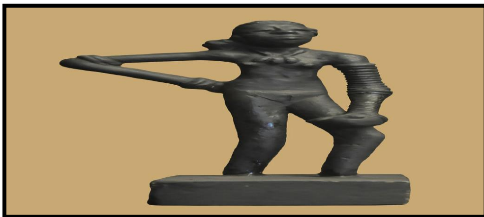
REPLICA OF 'DANCING GIRL' OF MOHENJO-DARO

Another figurine in bronze, known as the Dancing Girl , is only 11 centimeters high and shows a female figure in a pose that suggests the presence of some choreographed dance form enjoyed by members of the civilization.