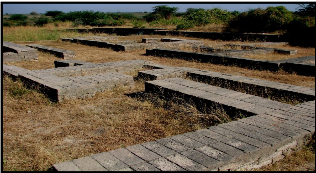
ARCHAEOLOGICAL REMAINS AT THE LOWER TOWN OF LOTHAL,

Mohenjo-Daro is thought to have been built in the twenty-sixth century B.C; it became not only the largest city of the Indus Valley Civilization but one of the world's earliest major urban centers. Located west of the Indus River in the Larkana District, Mohenjo-Daro was one of the most sophisticated cities of the period, with advanced engineering and urban planning.