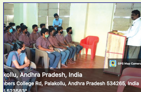
Palakollu, Andhra Pradesh, India Chambers College Rd, Palakollu, Andhra Pradesh 534265, India 13.523583°