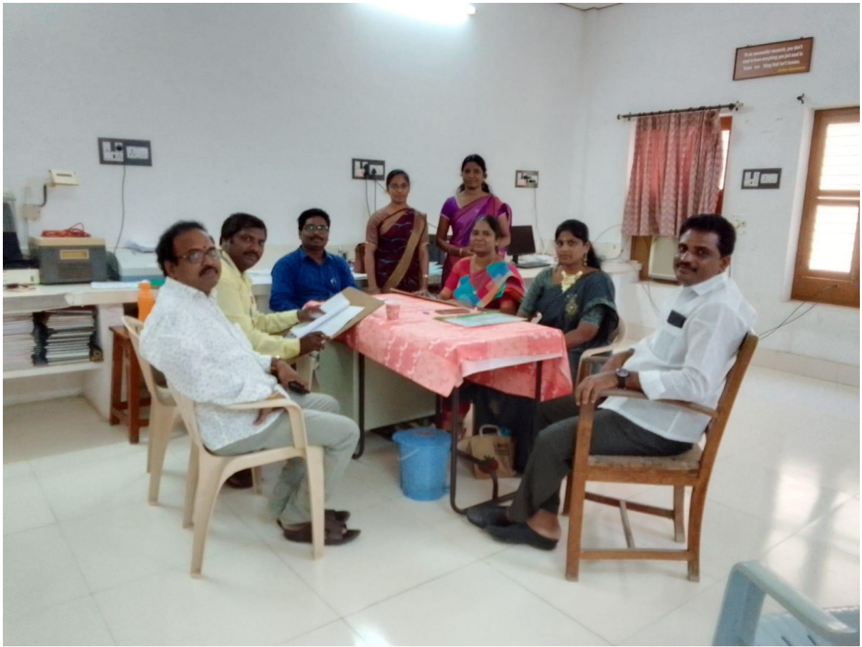
BOARD OF STUDIES MEETING (BOS)