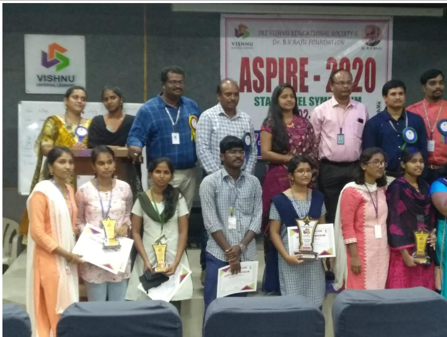
Prize Winners along with Principal, Convener, and Faculty of BV Raju College, Bhimavaram