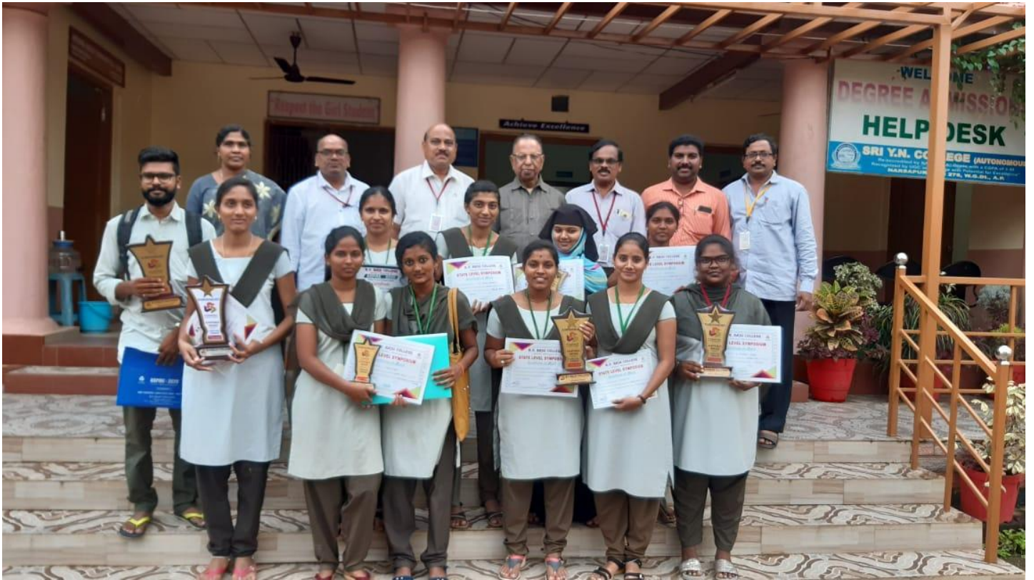
Prize Winners showing their Certificates and mementos