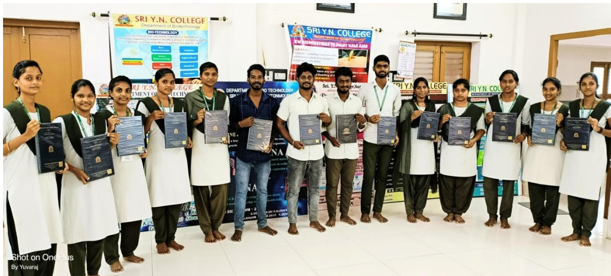
COMMUNITY SERVICE PROJECT ON DIABETICS AND OTHER CHRONIC DISEASES