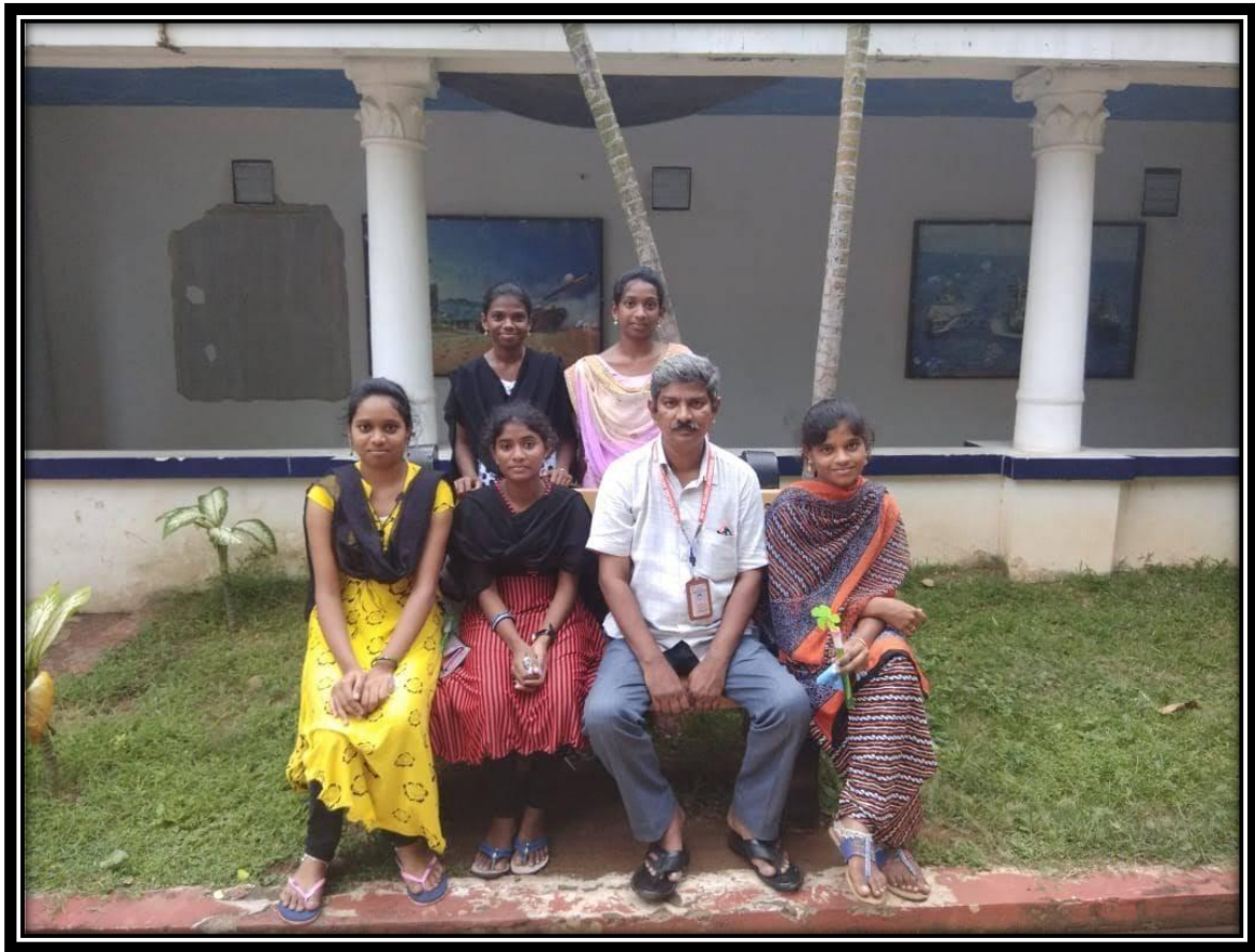
A PICTURE AT COTTAGE.