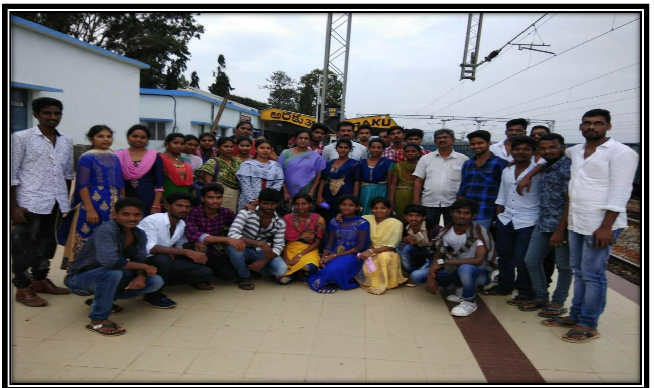
STUDENTS & STAFF GATHERING AT ARAKU RAILWAY STATION.