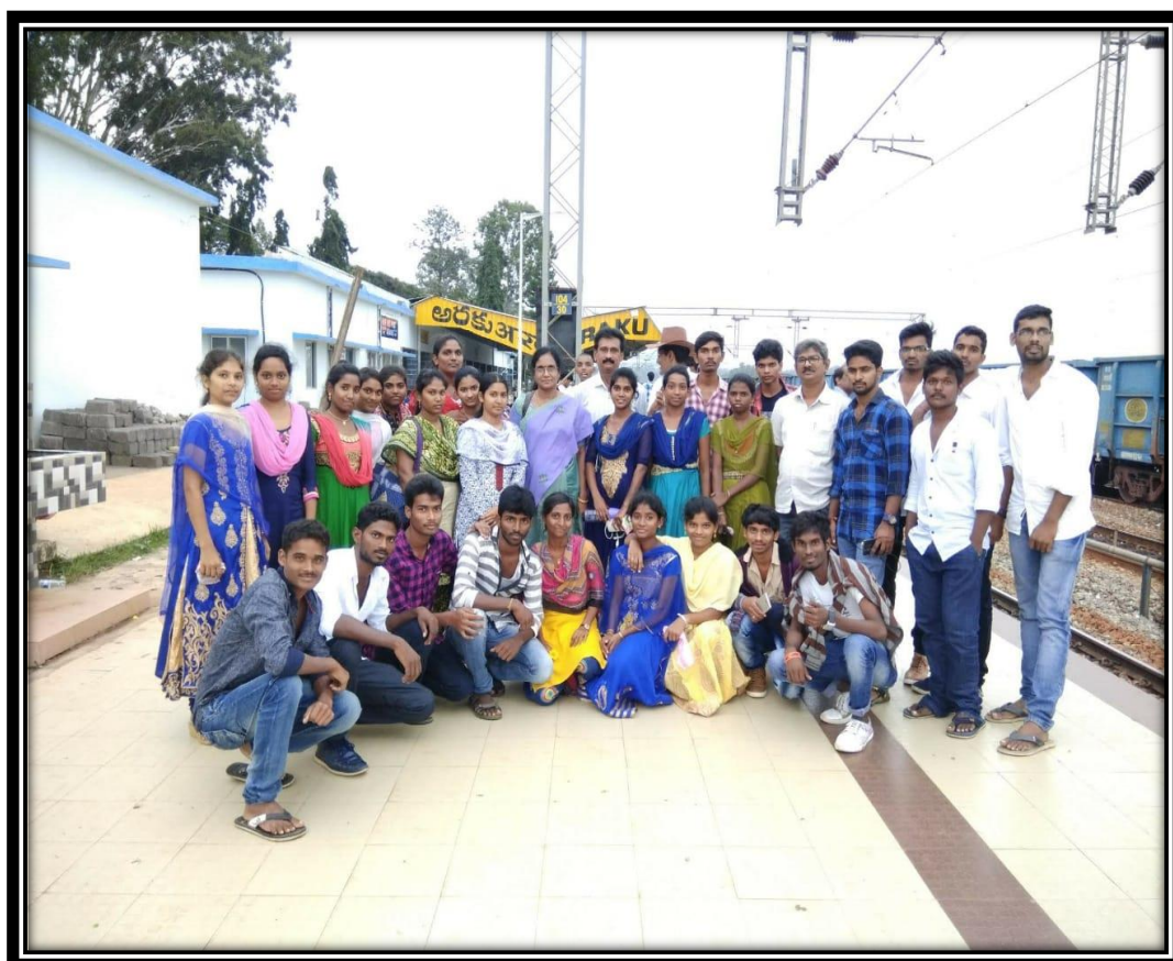
STUDENTS AND STAFF AT ARAKU RAILWAY STATION.