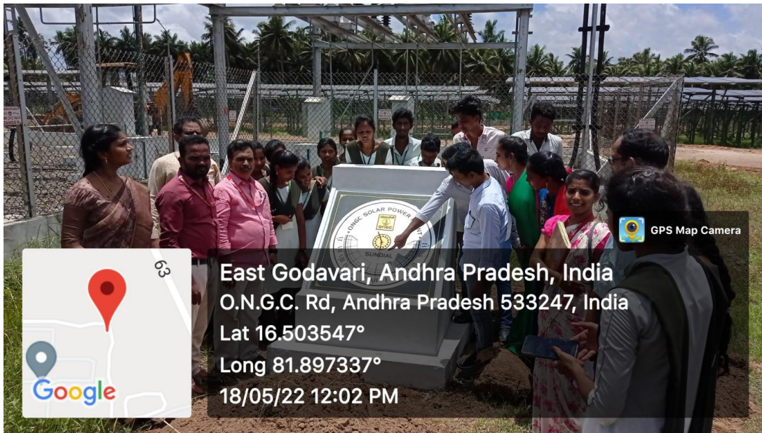
EXPLAINING OUR STUDENTS ABOUT OF sundial