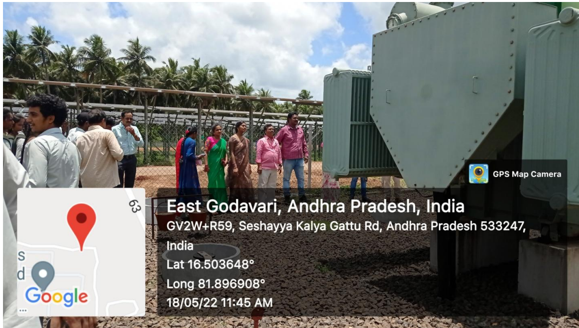
STUDENTS AT FIELD TRIP ALONG WITHS THE STAFF