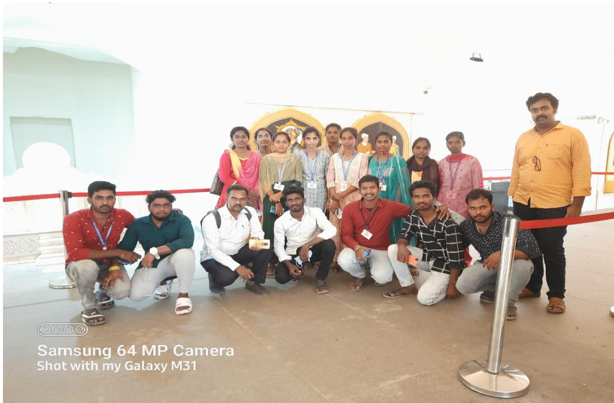
Students & Staff at museum