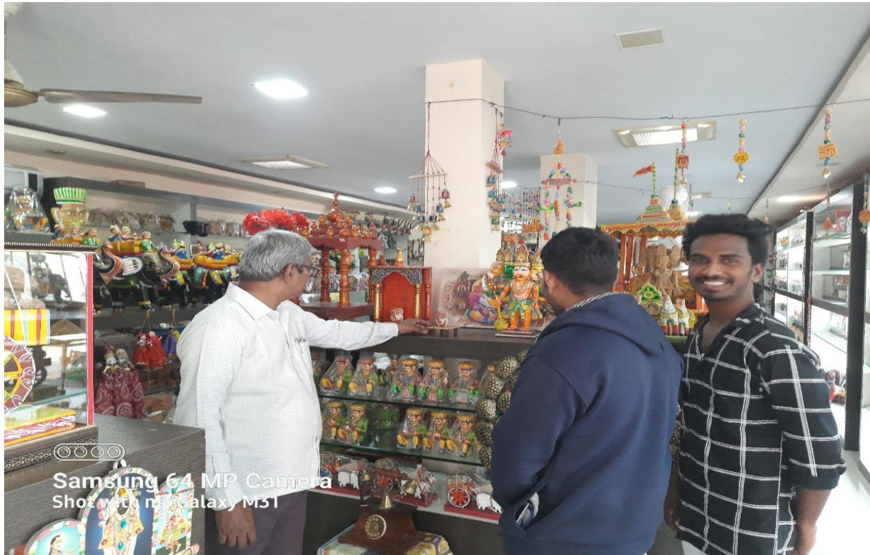
Students & Staff discuss the Toys