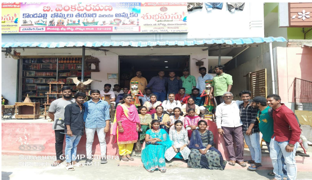
Students & Staff near Kondapalli Toys Shop