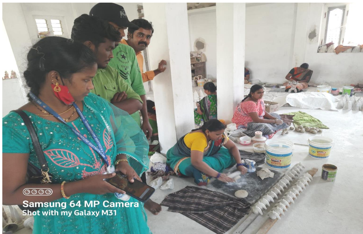
Students observing the Workers who are making Kondapalli Toys