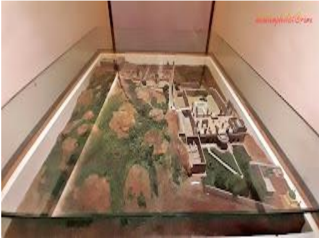
Kondapalli Archeology and Museum