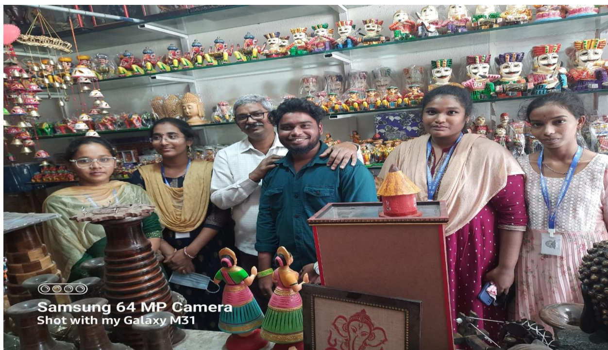
Staff & Students visiting the Kondapalli Toy shop