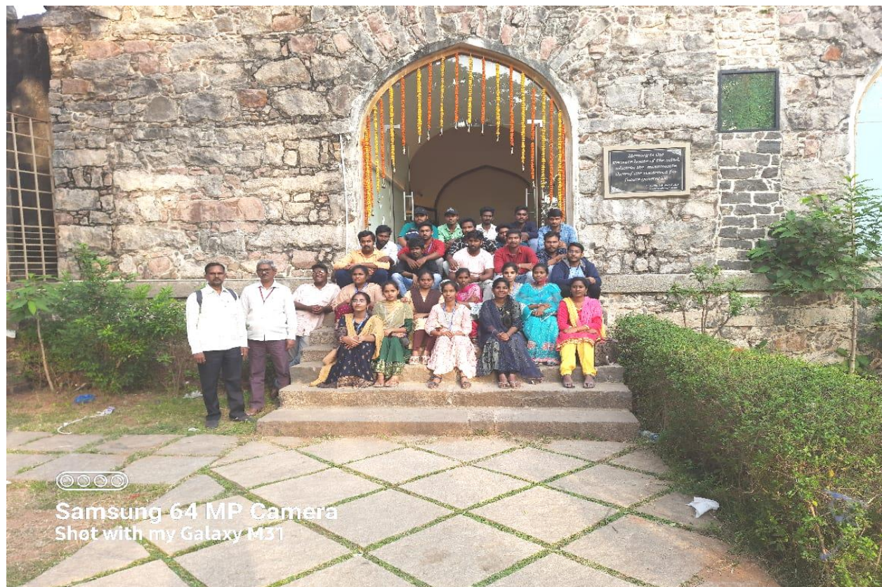
Kondapalli Fort entrance