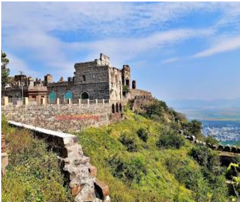
Kondapalli Fort in Vijayawada

The ancient Kondapalli Fort or Kondapalli Kota is a 14th-century fort of historical and tourist interest located near Vijayawada city of Andhra Pradesh .