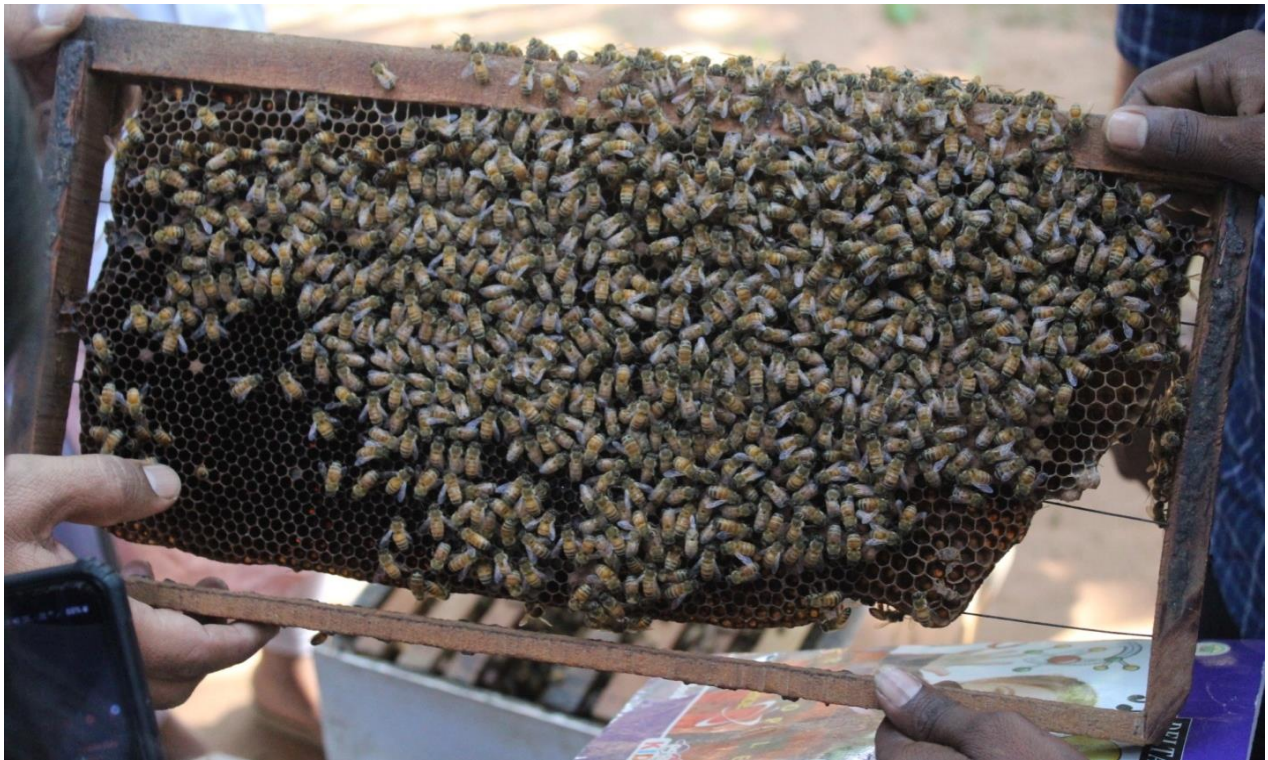
Bee Keeping Box and Trays