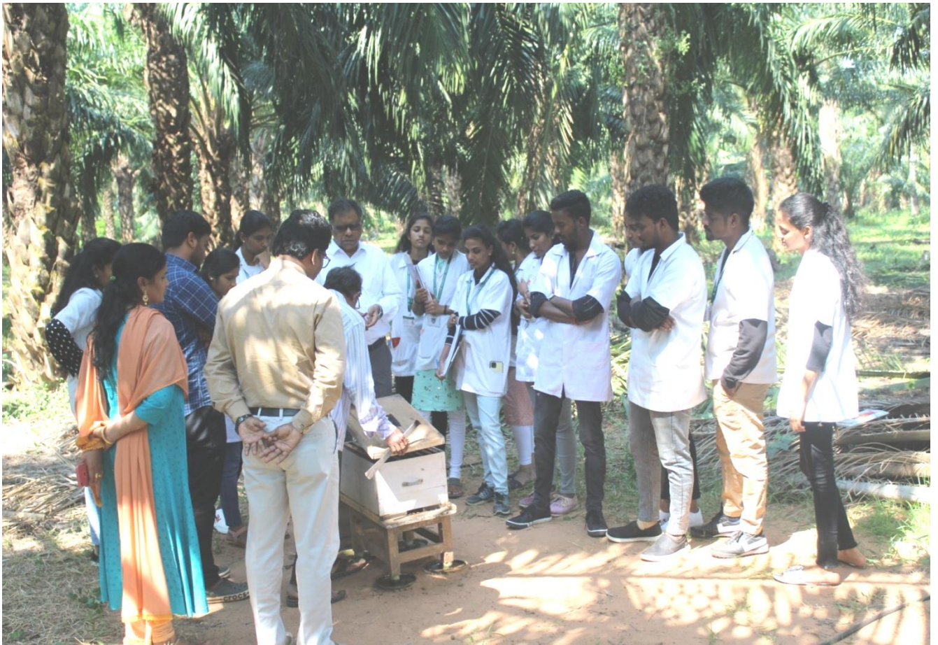
Handling of tools and techniques for apiculture