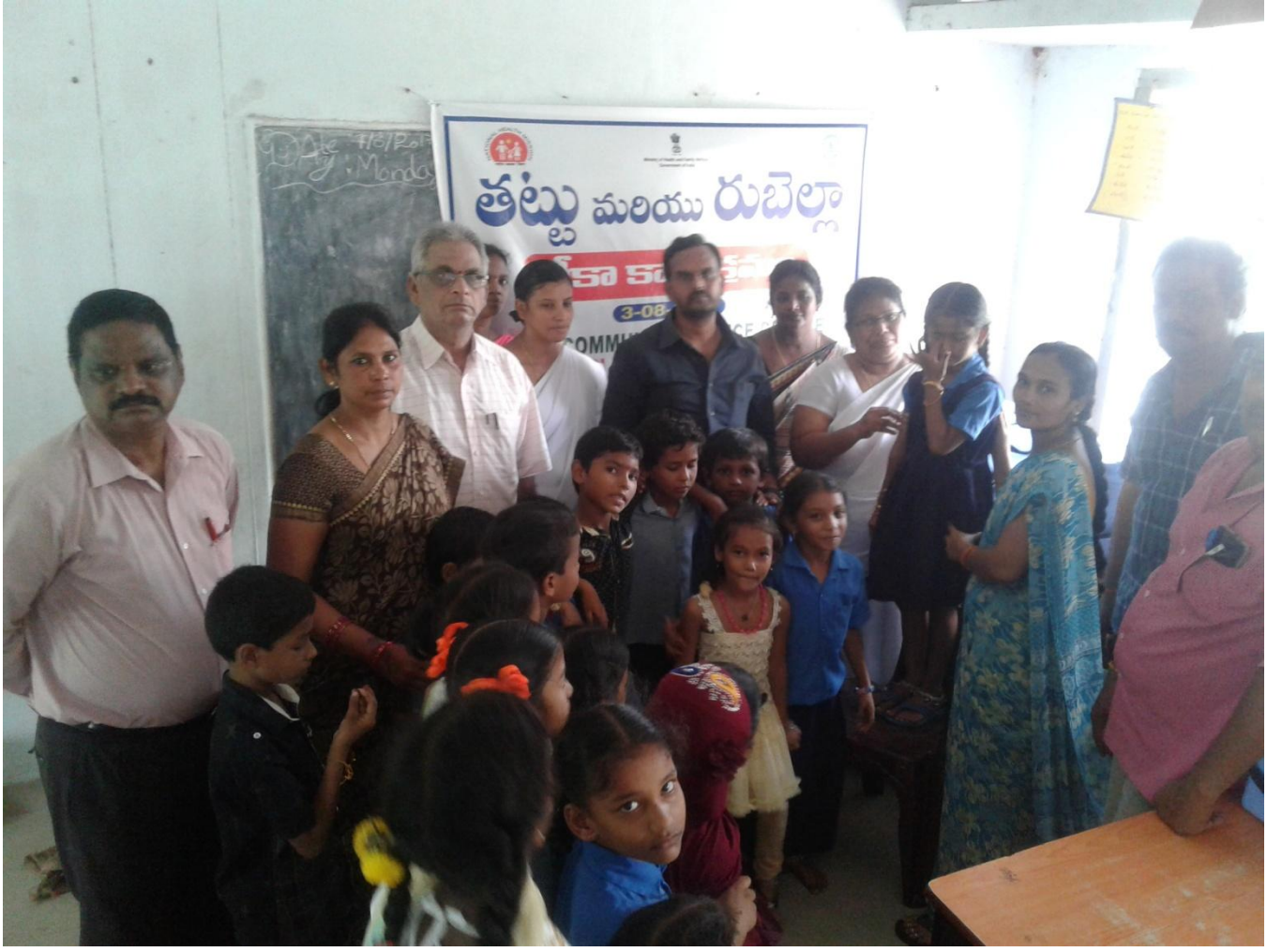
Vaccination programme conducted at Municipal Primary English Medium School, Sivalayam Road, Narsapur. School Teachers participated in this programme.