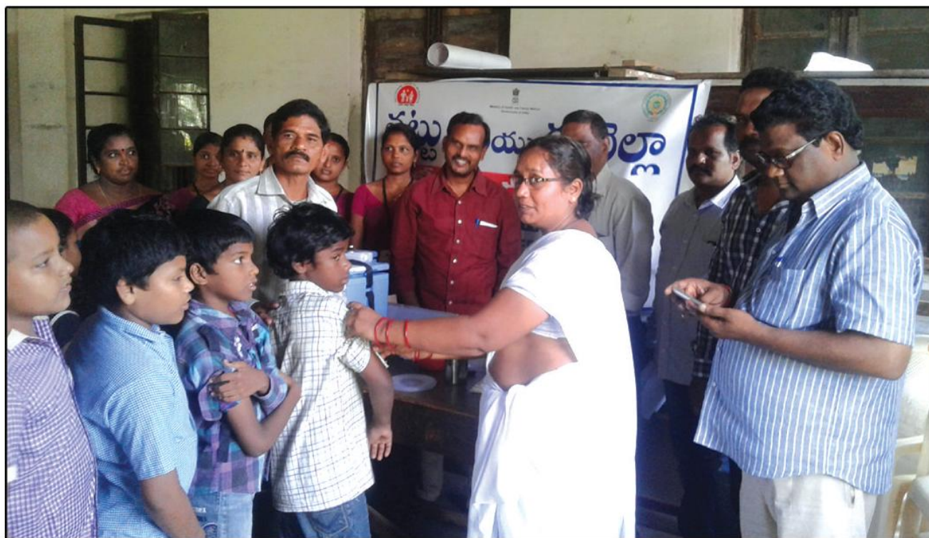
Vaccination programme conducted at Taylor Primary School, Narsapur.

On 03-08-2017 Our Community Service Centre conducted Vaccine Programme (Tattu and Rubella) in various school children of Narsapur town, under the health and hygienic programme.