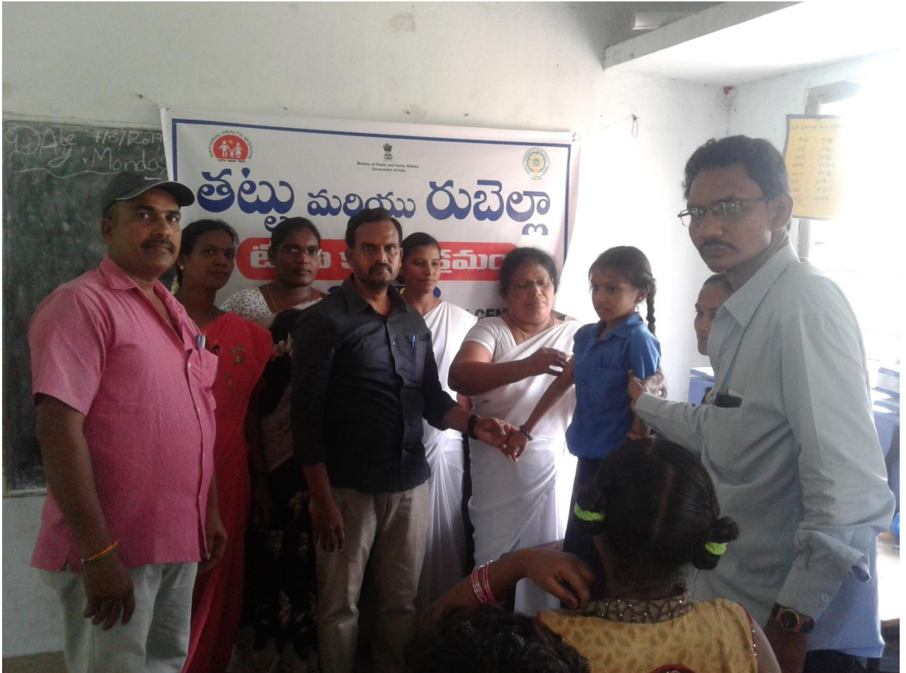
Vaccination programme conducted at Municipal Primary School, Park Road, Narsapur.

School Teachers participated in this programme.