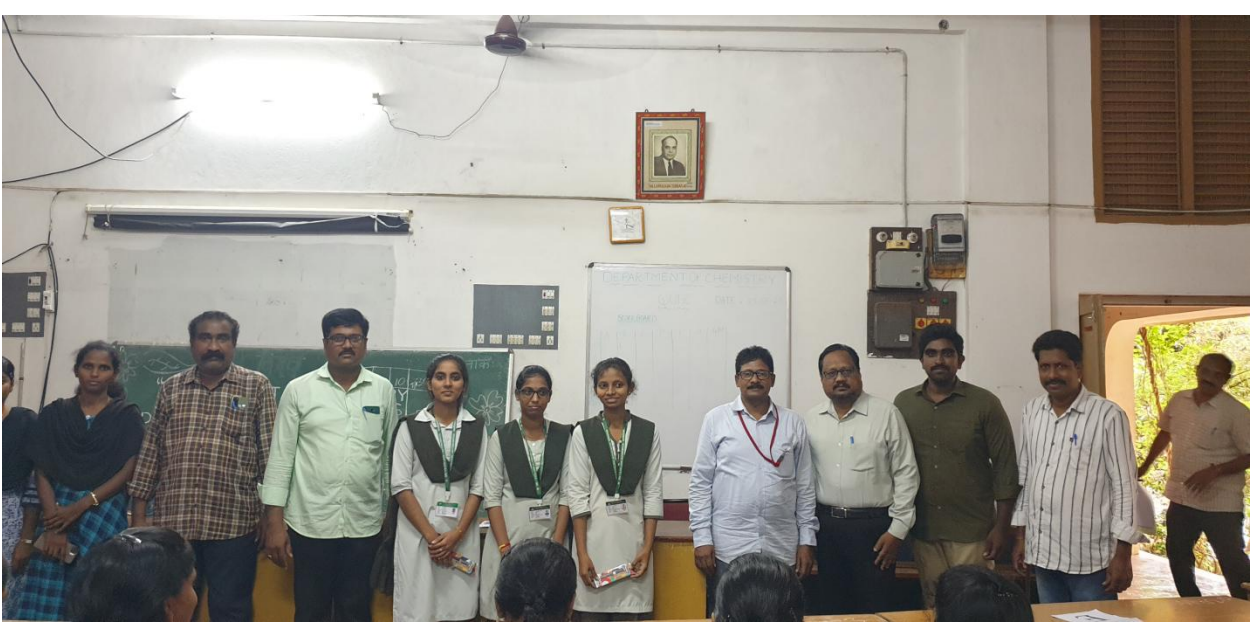
Runners (Team- B)