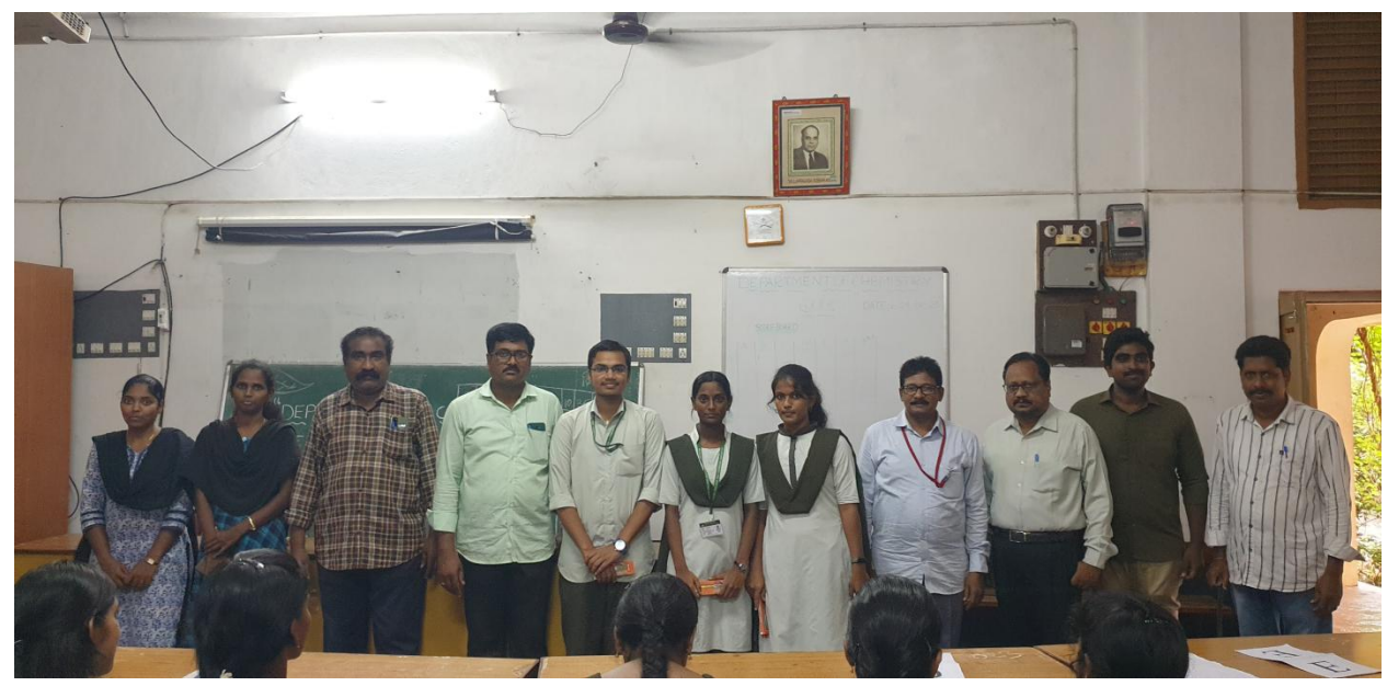
Winners (Team- E)