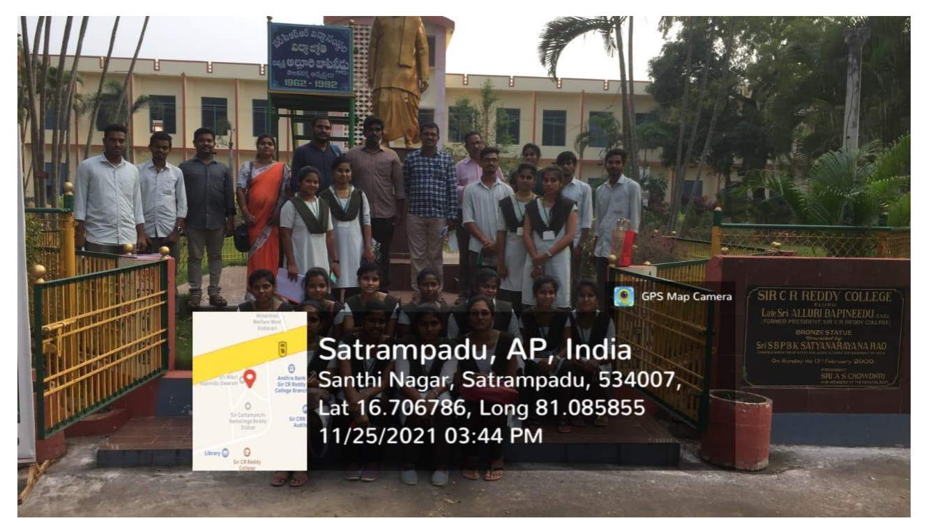
Sri YN College, Staff and students attended to this programme