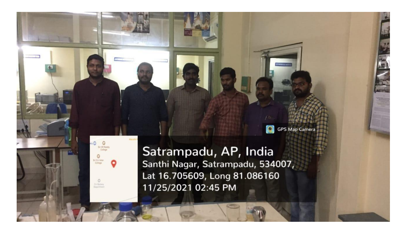
Students-Hands on experience