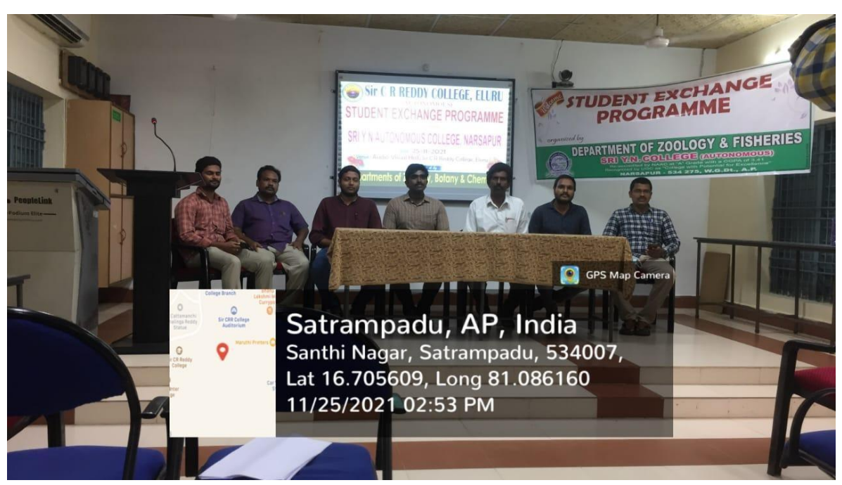
Faculty of Sri YN College and Sir CR Reddy College attended to this programme