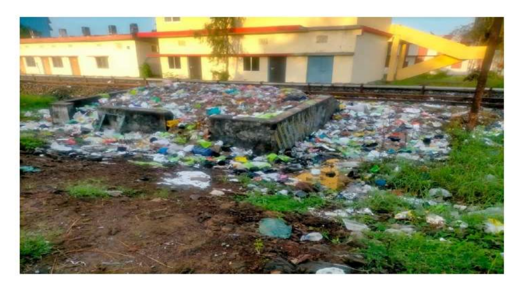
Solid waste generated from Railway Station, Narsapur Municipality

The collected data shows that the maximum proportion of refuse caused by food and vegetable wastes, second highest was fruits waste and plastic. Percentage of Plastic carry bags was higher, where glass, ceramic and metals were nearly equal with each other. Provision of litter bins at public places shall be made and there will compulsory segregation at all the sources. As the disposal site is at 3 km away and smaller vehicle are used for the transportation of solid waste. Recovery and reuse of material such as metal, plastic, glass and rubber etc. should be done throughout the year. System should be based on Environmental protection rules (Reduce, Recycle, Reuse and Recover) Public awareness, political will and public participation as essential for the successful implementation of the legal provisions and to have an integrated approach towards sustainable management of municipal solid wastes. There should be sufficient health and safety provisions for workers at all stages of waste handling. Annual report of addition of the strategies for collection of solid wastes have to be formulated.