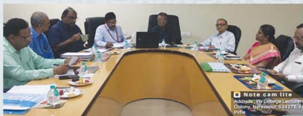
Academic Council Meeting conducted on 09-09-2022.