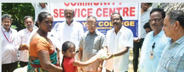
Distributed Food Packets to the Lockpeta, for Flood Effected Area People by the College Management on 19-7-2022