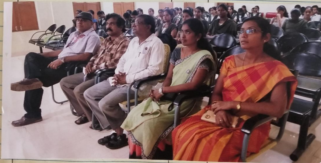
Staff and Students attended Guest Lecture.