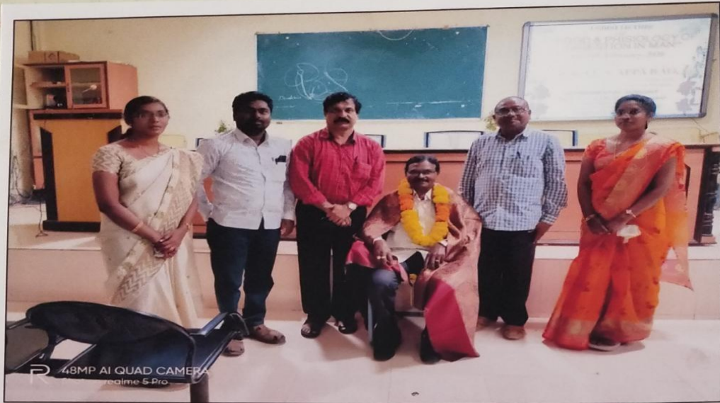
Felicitation to Guest Speaker and Dept. faculty members