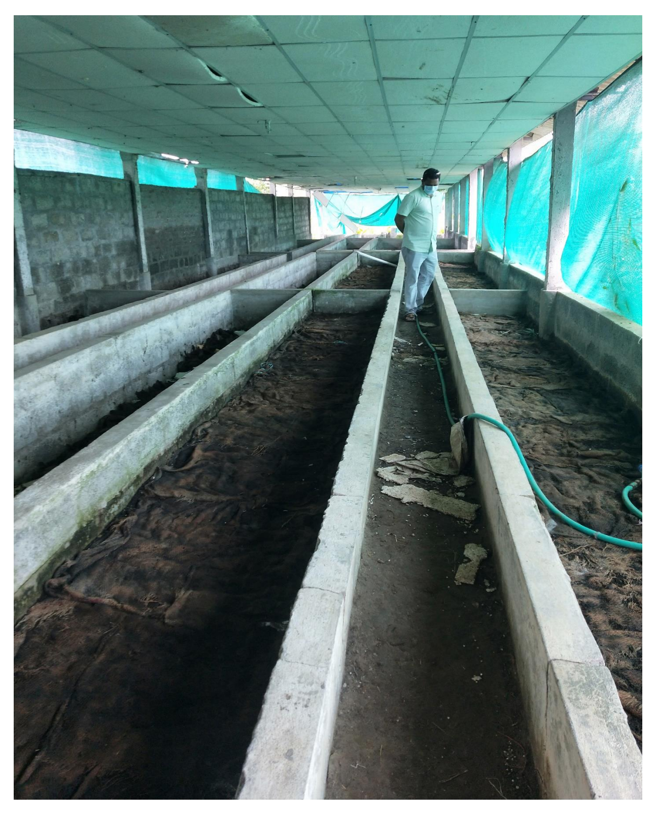
Figure showing Vermicompost bed sizes at Gondi Vermi compost center