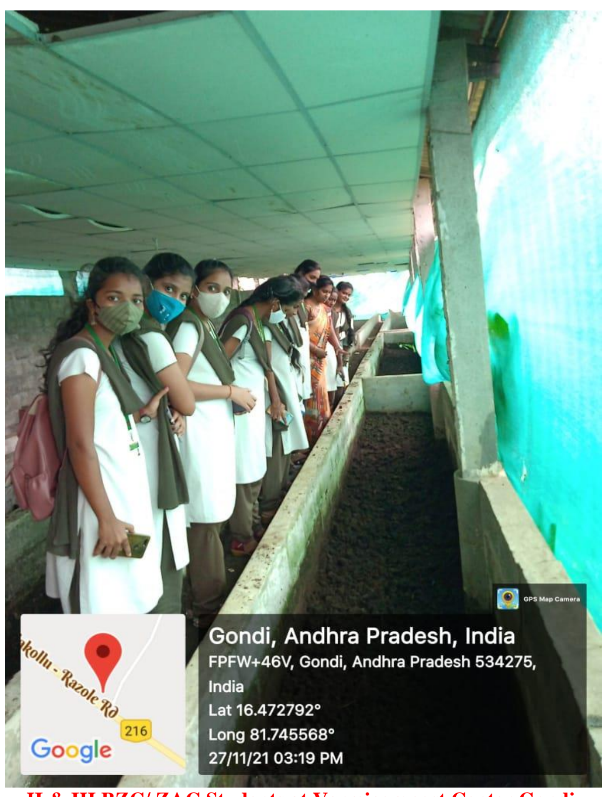
II & III BZC/ ZAC Students at Vermicompost Center Gondi.