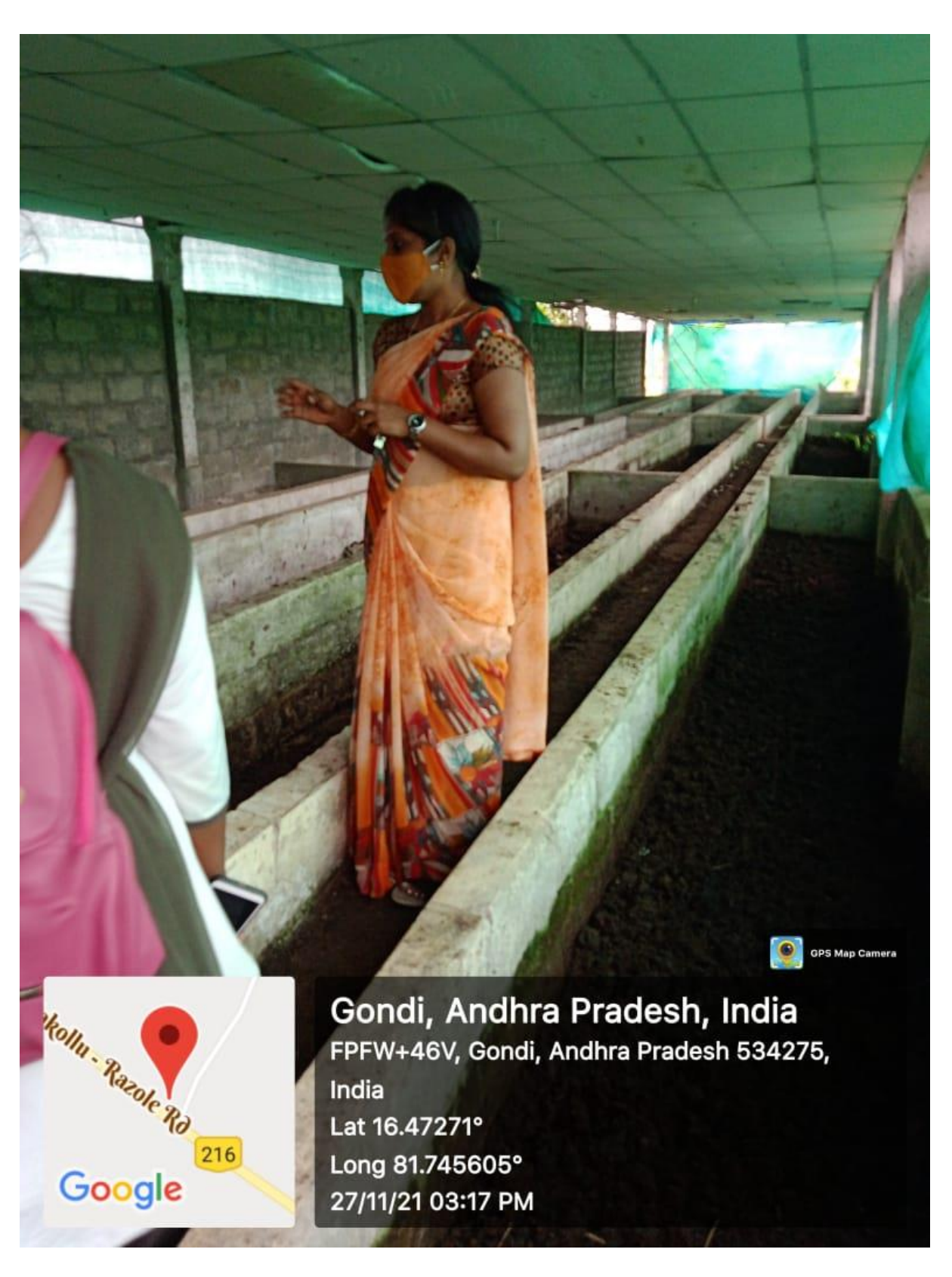
Identification of Earth Worm- Lumbricus terrestris their feeding habit and habitats