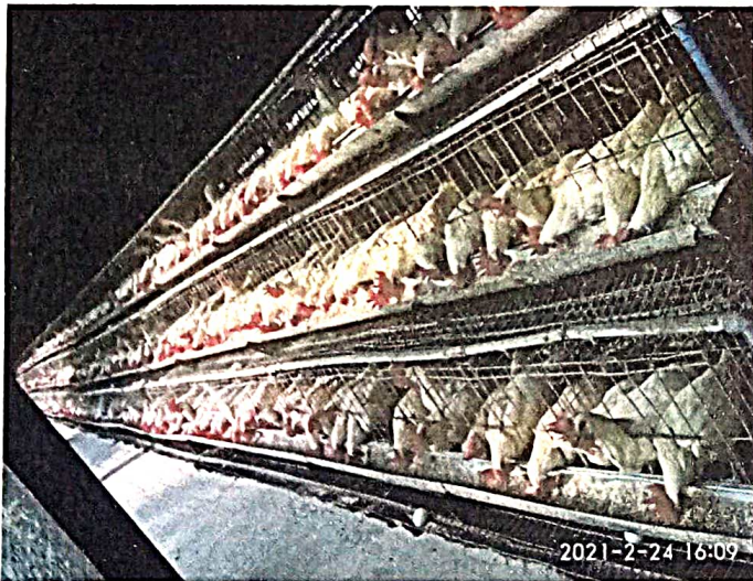
feeding of birds