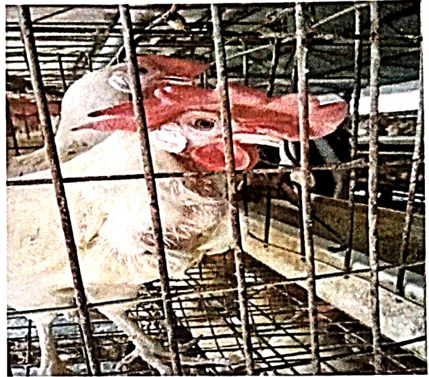
Birds in cage