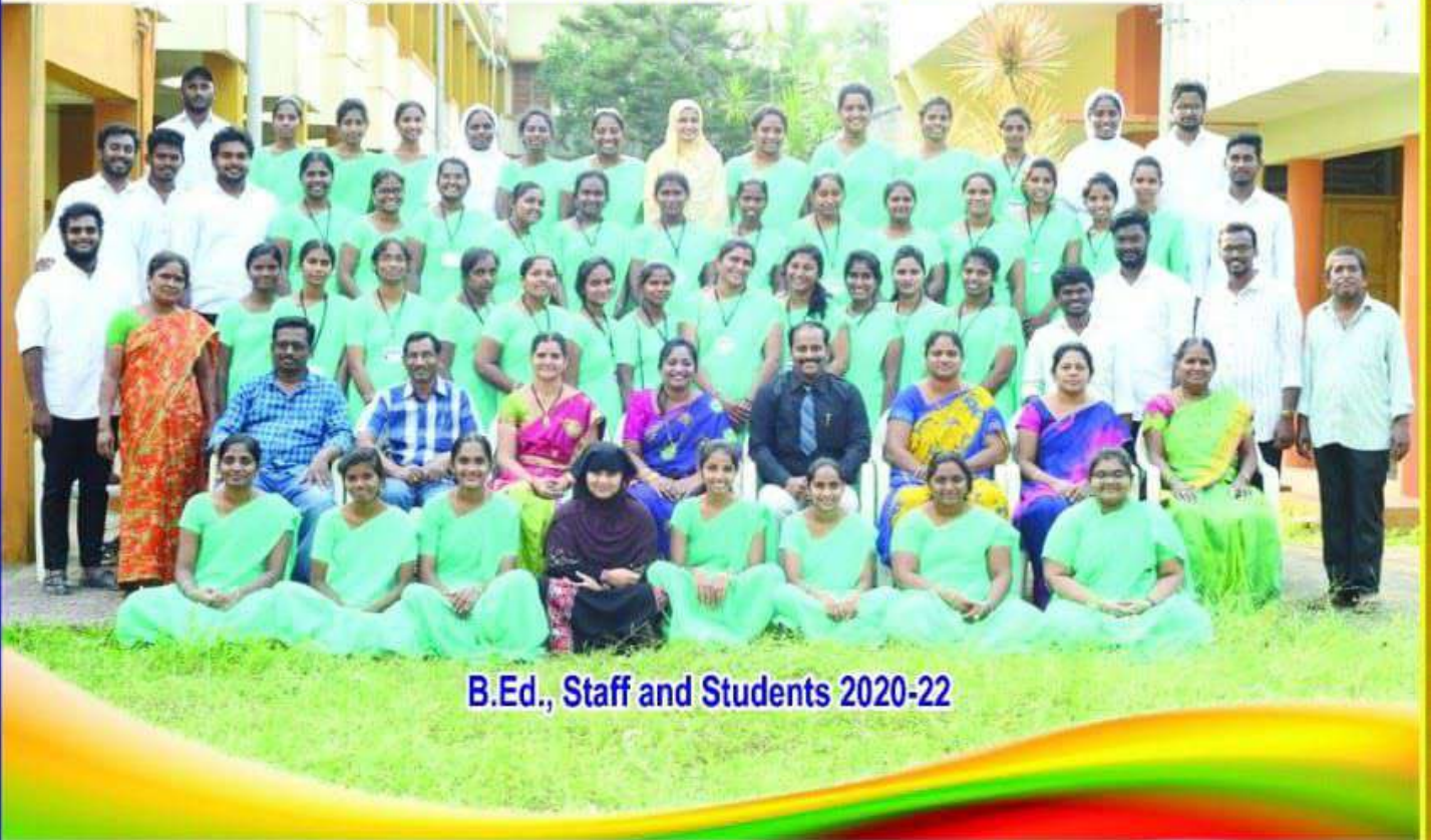
B.Ed., Staff and Students 2020-22

Thrice Accredited by NAAC at 'A' Grade | Recognized by UGC as "College with Potential for Excellence" Recognized by UGC as "Mentor Institution under Paramarsh Scheme" | An ISO 9001:2015 Certified Institution