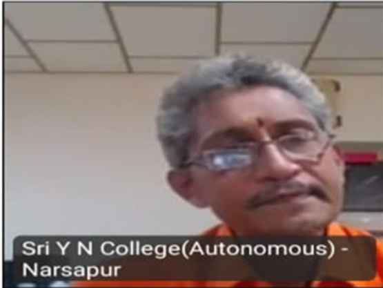
Sri Y N College(Autonomous) - Narsapur